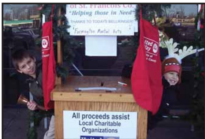
St. Joseph 3rd grade students participated in the United Way bell ringing this Christmas season.